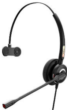
Fanvil - HT201

Fanvil HT201 & HT202 offer a range of premium quality headsets using Fanvil's innovative acoustic technology to deliver speech clarity and an excellent audio experience. Coupled with our sleek design that focuses on comfort and durability, the Fanvil HT201 & HT202 headset offers a new level of experience for call center professionals.