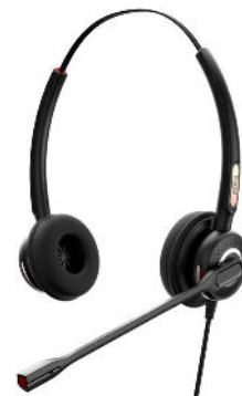
Fanvil - HT202