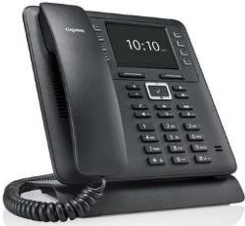
Main device with wired handset article number: S30853-H4008-R101