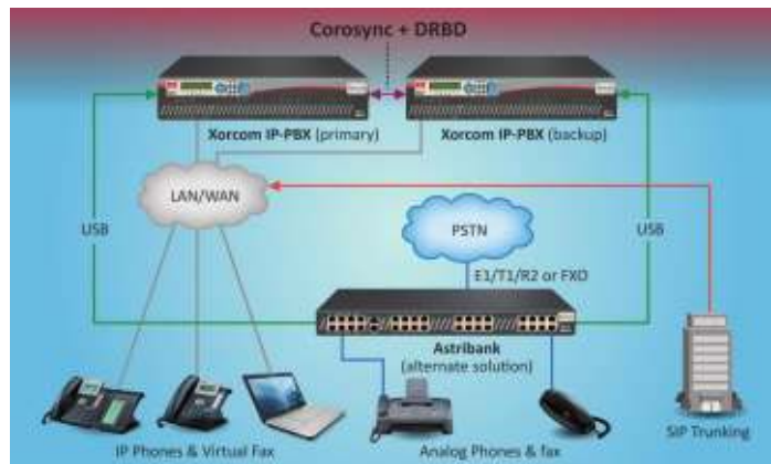
CTS3000 - TwinStar Plus configuration featuring dual CXE3000 servers including optional Astribank.

TwinStar Plus provides full redundancy for a complete PBX system, including telephony interfaces (if required). It can also be used in a pure SIP environment. A sophisticated automatic replication and detection mechanism detects server failure and switches all telephony to the backup server, keeping downtime to an absolute minimum.