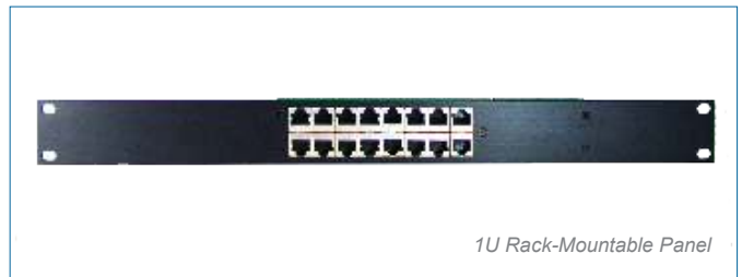
1U Rack-Mountable Panel