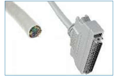
Punch Down Cable

IP/IPX over Frame Relay/ PPP/HDLC/X.25, X.25 over Frame Relay (Annex G), BSC over X.25, SNA over X.25, PPPoE, PPPoA, IP over ATM