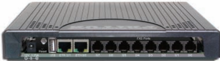
2-Ethernet-port version (eSBC software upgrade option)