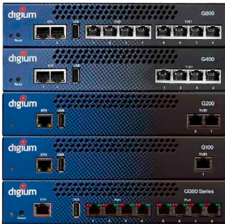
The Digium family of gateways

Deployed in any application, Digium gateways will provide proven reliability for a fraction of the cost of other gateway platforms on the market. They are easy to set up and include an API that reduces administration and troubleshooting costs for any organization, from a small business to a large enterprise.