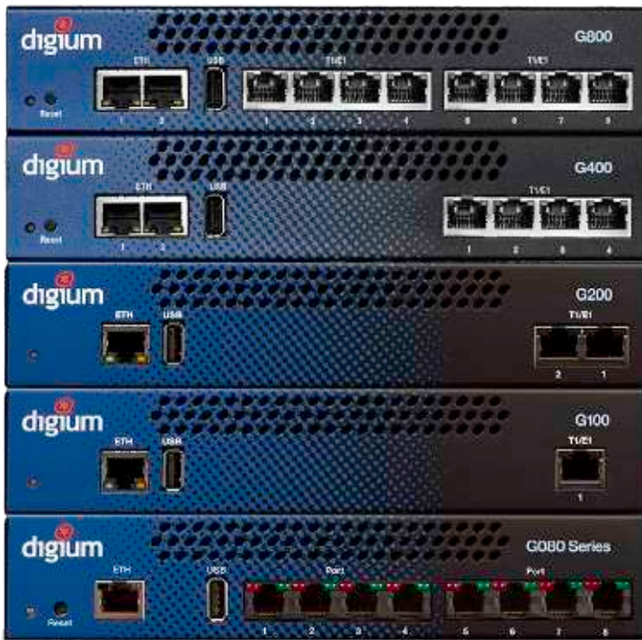
The Digium family of gateways

Deployed in any application, Digium gateways will provide proven reliability for a fraction of the cost of other gateway platforms on the market. They are easy to set up and include an API that reduces administration and troubleshooting costs for any organization, from a small business to a large enterprise.