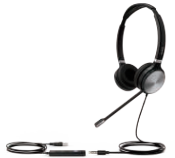
UH36 Dual Teams UH36 Dual UC