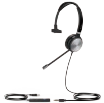
UH36 Mono Teams UH36 Mono UC

Deeply integrated with Yealink IP phones that the advanced features, such as volume synchronization and multiple calls control, are just right at your fingertips.