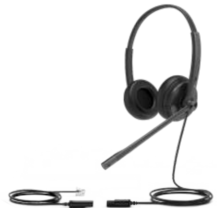
YHS34/YHS34 Lite Dual