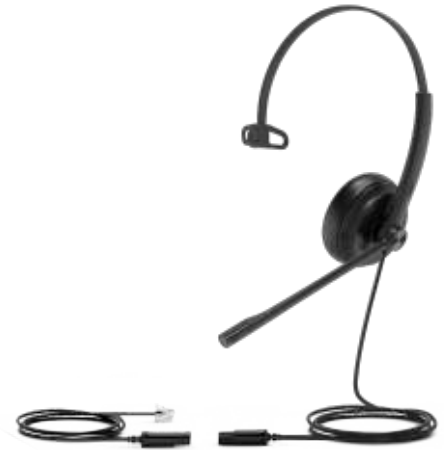
YHS34/YHS34 Lite Mono

Built for comfort with soft ear cushions and ultra-lightweight materials, the YHS34/YHS34 Lite is 10%~30% lighter than other headsets in the same range. Its ergonomic design makes this headset comfortable enough for long conference calls and all day use.